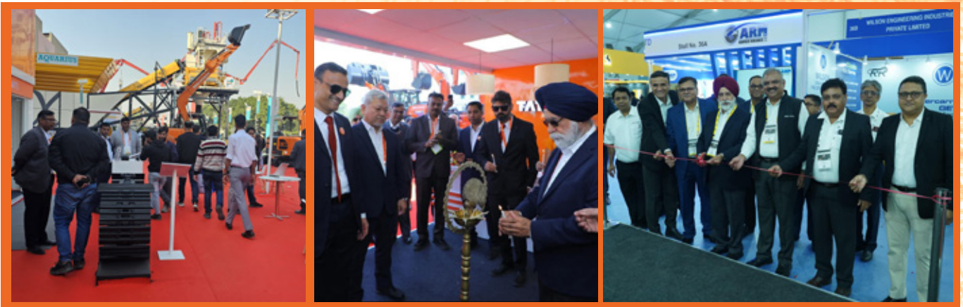
Tata Hitachi proudly participated in Bauma Conexpo 2024 at Greater Noida from 11 th to 14 th December, showcasing our advanced construction solutions and fostering industry connections.

On 5 th November 2024, Tata Hitachi's Kharagpur and Dharwad Manufacturing facilities came together to commence Quality Month with great enthusiasm. The ceremony emphasized the powerful theme, "Quality is not an act, it's a habit," reflecting the organization's steadfast commitment to excellence.