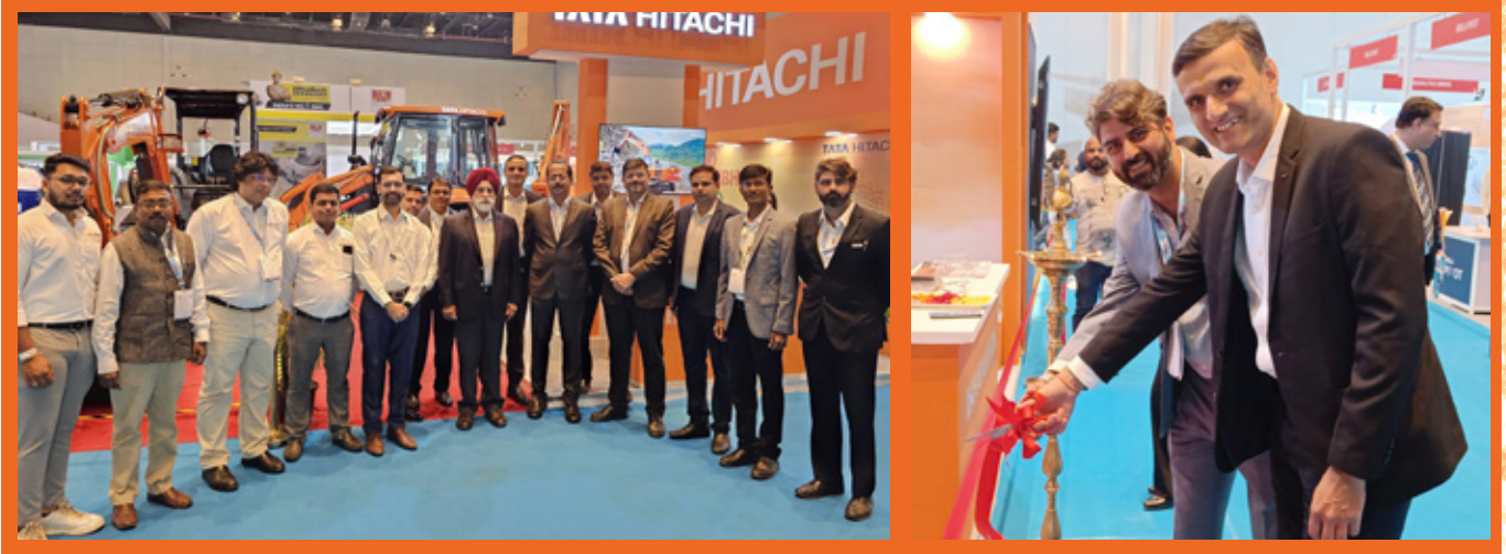
Tata Hitachi participated in the RAHSTA Expo in Mumbai on 9 th & 10 th October 2024, showcasing innovative construction solutions and strengthening industry collaborations.