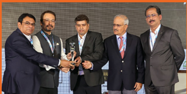
Award Category – Best After Sales Service