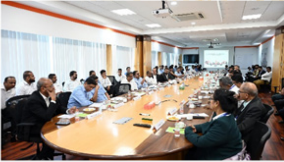
Vendor Town Hall meeting was organized at the plant on 26 th Nov'24. Categories covered were : ERH and CFM Commodities.