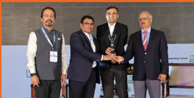
Award Category – Best Seller in Mini Excavator