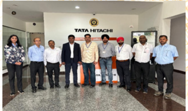
On 4 th December 2024, KA customers from the Chandigarh Branch visited our facility. The visit was a valuable opportunity to strengthen customer relationships, showcase our operational excellence, and discuss future collaborations.