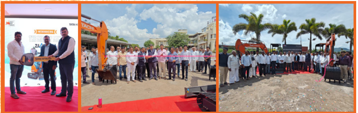
Glimpses from the launch event of Tata Hitachi's XAXIS 38U and, the The Mighty Mini and NX50, the NEXT GEN Series hydraulic excavator held on 4 th October 2024 at Karad. The event was graced by our esteemed customers, senior management of Tata Hitachi and Autobahn Trucking Corporation Pvt. Ltd, Tata Hitachi's authorized dealership.