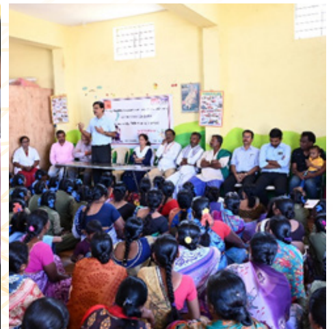
On 8 th November 2024, a health camp was organized at Kurabagatti School, focusing on the well-being of female students. In collaboration with the Family Planning Association of India (FPAI), HPV (Human Papillomavirus) vaccines were administered. This initiative underscores a strong commitment to safeguarding health and promoting awareness among young girls.