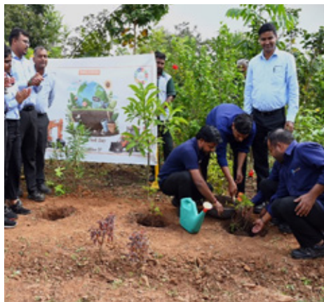
5 th December is celebrated as World Soil Day. Dharwad Plant celebrated this day with zeal and enthusiasm. Tree plantation drive was conducted on this occasion. Plant Sr. Management, EEC members, WAG team members participated in this event. Also, poster competition was held on this occasion and prizes were distributed to the winners. Also, Plant Head shared his pov on the importance of soil and its conservation.