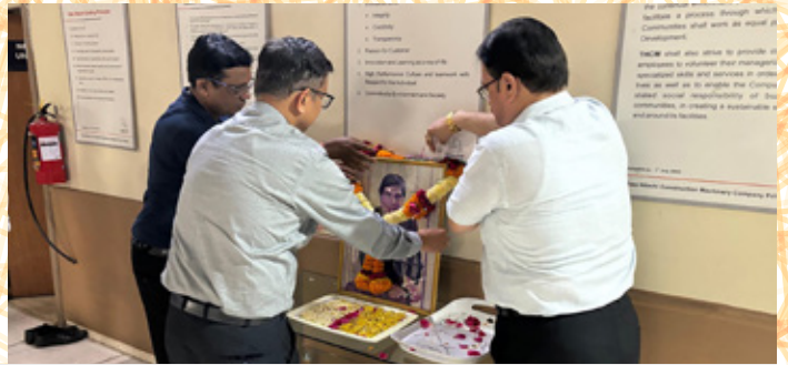
Honoring a Visionary: Staff and executives from Tata Hitachi Construction Machinery, Nagpur and Swetal Logistics gathered at the Nagpur Central Warehouse to pay tribute to Shri Ratan Tata, celebrating his unparalleled contributions to industry, philanthropy, and nation-building.