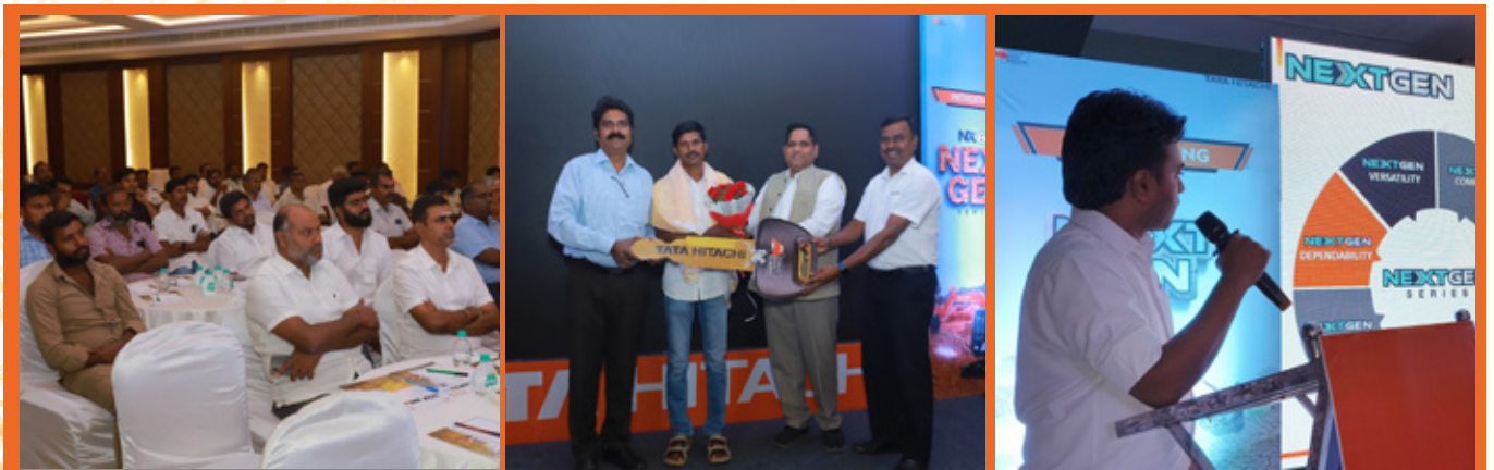
Glimpses from the launch event of Tata Hitachi's NX80, the NEXT GEN hydraulic excavator held on 19 th Nov '24 at Kottayam. The event was graced by our esteemed customers, senior management of Tata Hitachi and PSN Construction Equipment, Tata Hitachi's authorized dealership.