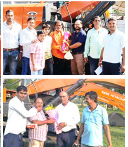
Key handovers by Team Trishul Tread Pvt Ltd.