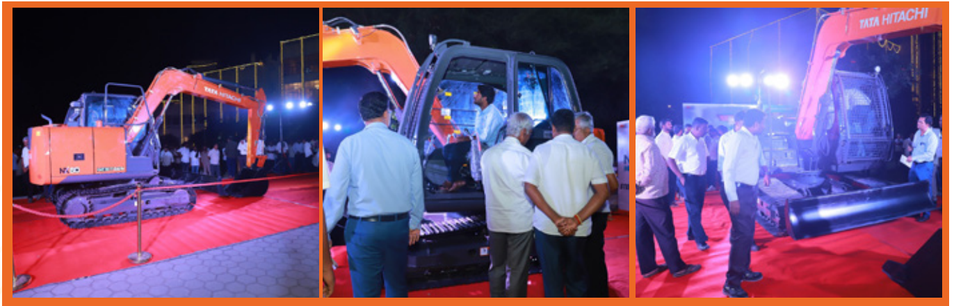
Glimpses from the launch event of Tata Hitachi's NX80, the NEXT GEN hydraulic excavator held today at Coimbatore on 23 rd Dec '24. The event was graced by our esteemed customers, senior management of Tata Hitachi and PPS Motors, Tata Hitachi's authorized dealership.

Unveiling ground-breaking innovations with our latest product launches, designed to redefine efficiency and performance in construction and mining.