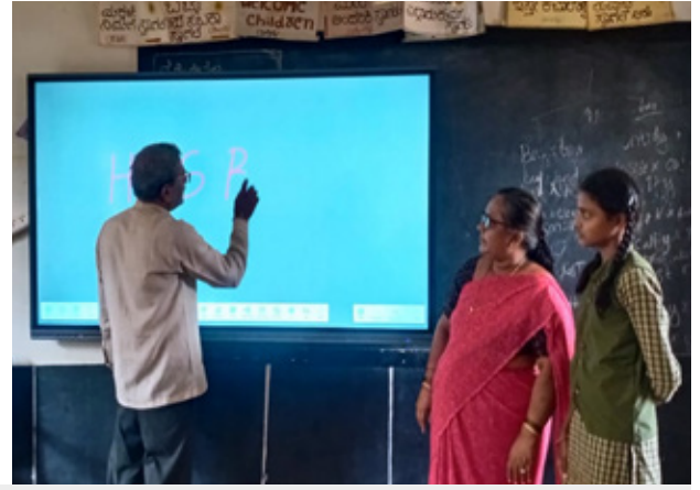
In October 2024, Tata Hitachi demonstrated its commitment to community development and education by donating smart boards to Mummigatti and Belur Government Schools. This initiative aims to enhance the learning experience for students by incorporating advanced technology into their classrooms, fostering an interactive and engaging educational environment.