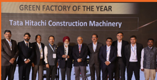
Award Category – Green Factory of the Year

These prestigious accolades underscore our commitment to excellence, sustainability, and customer satisfaction. A heartfelt thank you to our customers, partners, and the incredible Tata Hitachi family for their unwavering support and trust in us. Together, we continue to build a legacy of innovation and leadership in the construction equipment industry!