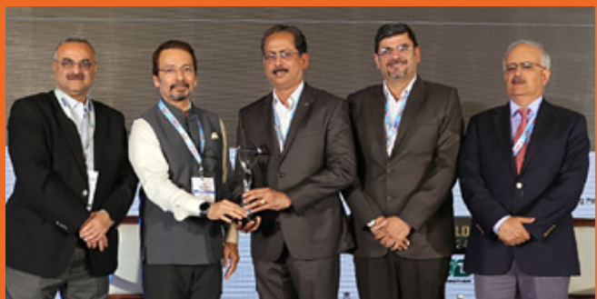
Award Category – Best Seller in Crawler Excavator