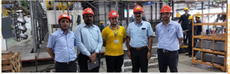
The environmental compliance audit of the Dharwad Plant, conducted by ERM India Private Limited on behalf of HCM, was successfully completed in October 2024. This thorough assessment underscores Tata Hitachi's commitment to environmental sustainability and compliance with regulations. The audit highlighted the plant's adherence to environmental standards, further reinforcing the company's dedication to responsible operations and sustainable practices.