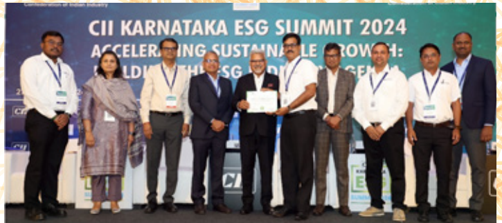
Dharwad manufacturing facility was recognized as a Winner in the 2 nd Edition of CII Karnataka ESG Summit 2024 'Accelerating Sustainable Growth - Building the ESG Industry Agenda' held on 27 th November 2024, organized by CII Karnataka.