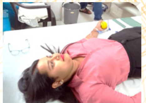
Trishul Tread Pvt. Ltd., Bhubaneswar, demonstrated its commitment to employee welfare and social responsibility by organizing its Annual Blood Donation Camp and a Free Health Check-Up Camp. The initiative saw enthusiastic participation from employees, highlighting their dedication to community service and personal health. The blood donation camp contributes significantly to saving lives, while the health check-up ensures the well-being of the team, fostering a healthy and motivated workforce.