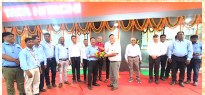
We are delighted to announce the opening of two new touchpoints by Trishul Trade PCT Limited, the official Tata Hitachi dealership, at Jeypore and Paradeep in Odisha. These new facilities are set to enhance customer experience, providing comprehensive support and accessibility to Tata Hitachi's products and services. This expansion reflects our commitment to strengthening partnerships and meeting the needs of our valued customers across the region.