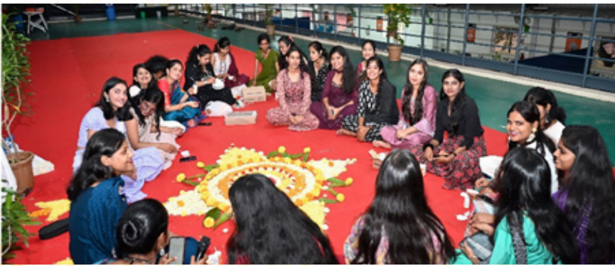
The WAG Team celebrated Diwali with great enthusiasm on 30 th October 2024. The event was marked by vibrant decorations, festive lights, and an atmosphere filled with joy and camaraderie. Team members exchanged warm greetings and indulged in festive activities, embodying the spirit of togetherness and celebration. The occasion was a perfect blend of tradition and unity, making it a memorable Diwali for everyone present.